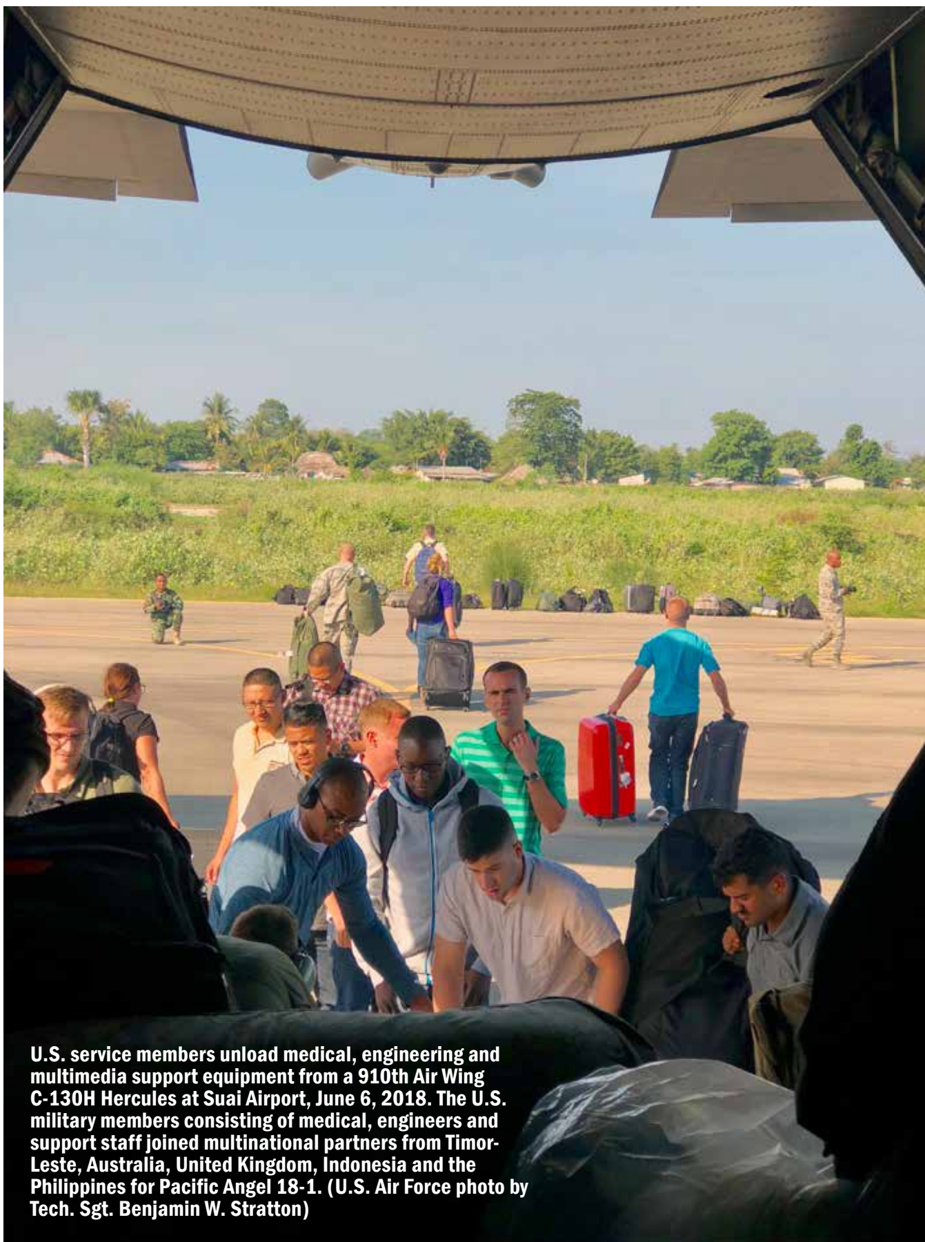
U.S. service members unload medical, engineering and multimedia support equipment from a 910th Air Wing C-130H Hercules at Suai Airport, June 6, 2018. The U.S. military members consisting of medical, engineers and support staff joined multinational partners from Timor-Leste, Australia, United Kingdom, Indonesia and the Philippines for Pacific Angel 18-1.