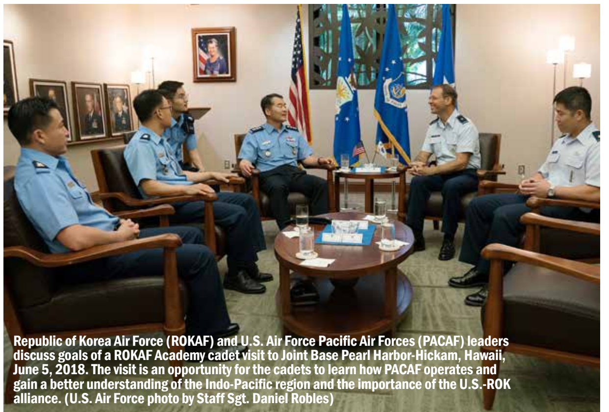
Republic of Korea Air Force (ROKAF) and U.S. Air Force Pacific Air Forces (PACAF) leaders discuss goals of a ROKAF Academy cadet visit to Joint Base Pearl Harbor-Hickam, Hawaii, June 5, 2018. The visit is an opportunity for the cadets to learn how PACAF operates and gain a better understanding of the Indo-Pacific region and the importance of the U.S.-ROK alliance.