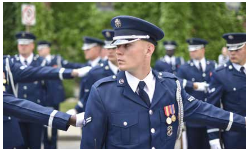
U.S. Air Force Honor Guardsmen march toward the Soldiers and Sailors Monument during the Indianapolis Power and Light 500 Festival Parade in Indianapolis, Ind., May 26, 2018. More than 300,000 people attended the IPL 500 to see floats, giant helium balloons, celebrities, award winning bands and racers competing in the 102nd Indy 500.