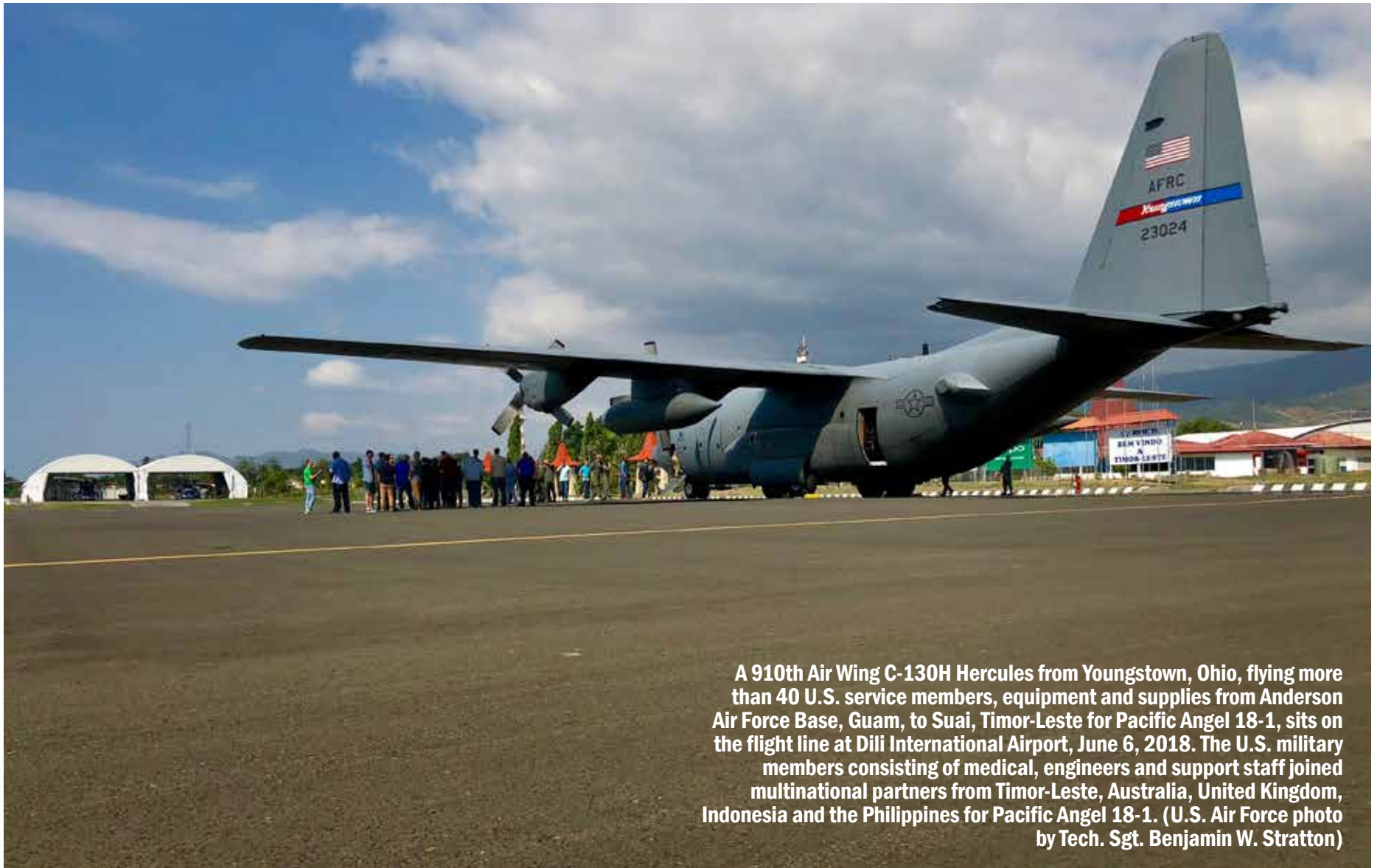
A 910th Air Wing C-130H Hercules from Youngstown, Ohio, flying more than 40 U.S. service members, equipment and supplies from Anderson Air Force Base, Guam, to Suai, Timor-Leste for Pacific Angel 18-1, sits on the flight line at Dili International Airport, June 6, 2018. The U.S. military members consisting of medical, engineers and support staff joined multinational partners from Timor-Leste, Australia, United Kingdom, Indonesia and the Philippines for Pacific Angel 18-1.