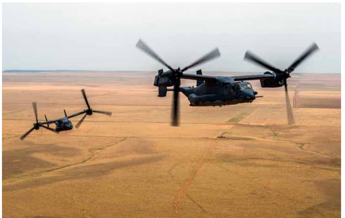
T wo CV-22 Osprey aircraft fly close together during the Cannon Air Show, Space and Tech Fest at Cannon Air Force Base, N.M., May 26, 2018. The Osprey aircraft participated in the air show by demonstrating their full capabilities in a rescue-scenario exercise. ►