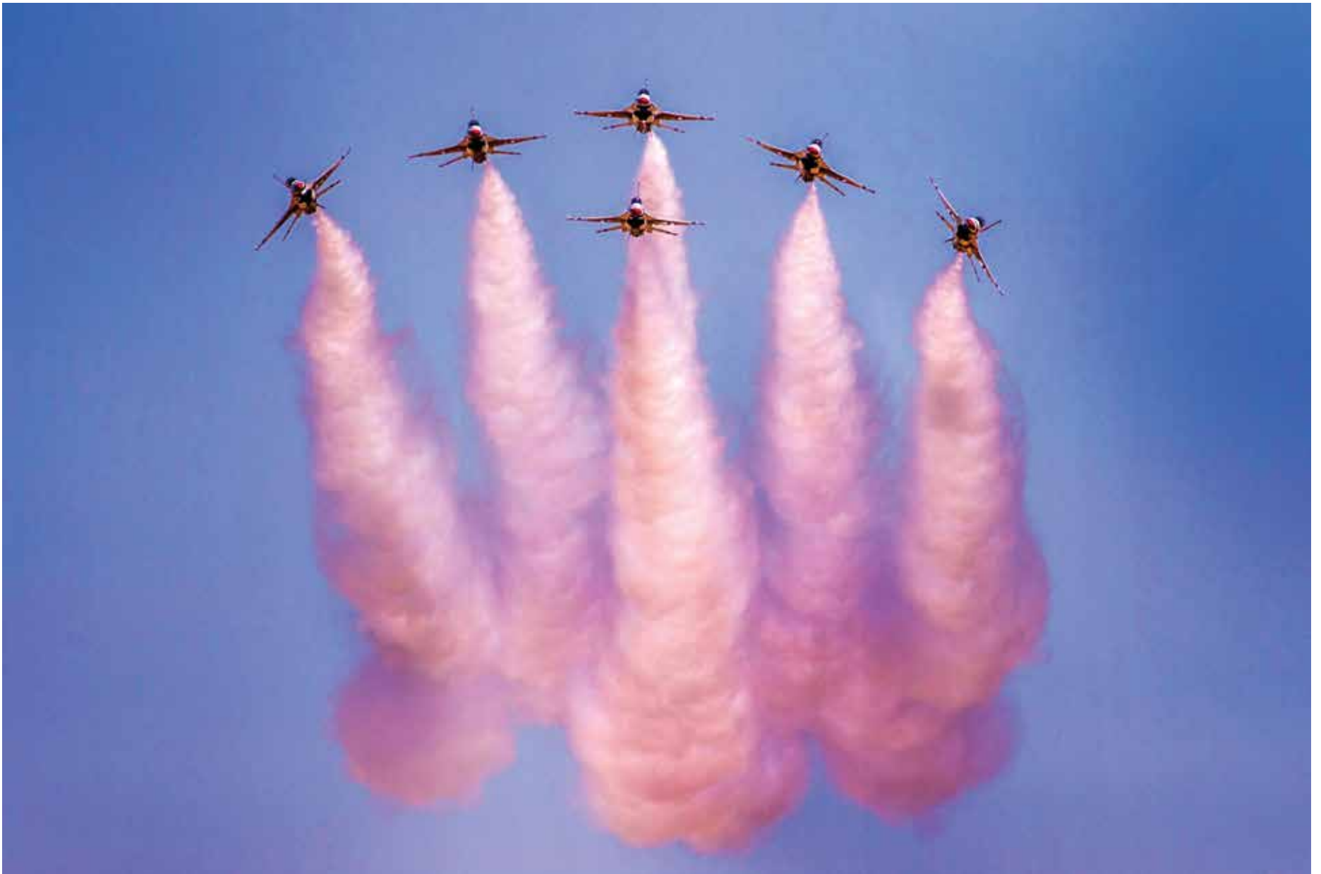
T he U.S. Air Force Thunderbirds practice their aerial performance over Cannon Air Force Base, N.M., May 25, 2018. The Thunderbirds practiced to perform twice over the Memorial Day weekend for the 2018 Cannon Air Show, Space and Tech Fest. ▲